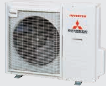
DXC24-28ZRA-W / SRC24YRA-W