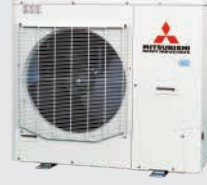
FDCA100VNA-W (1PH) / FDCA100VSA-W (3PH)